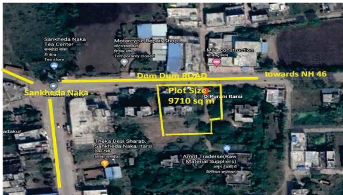
Connectivity of subject site to road network