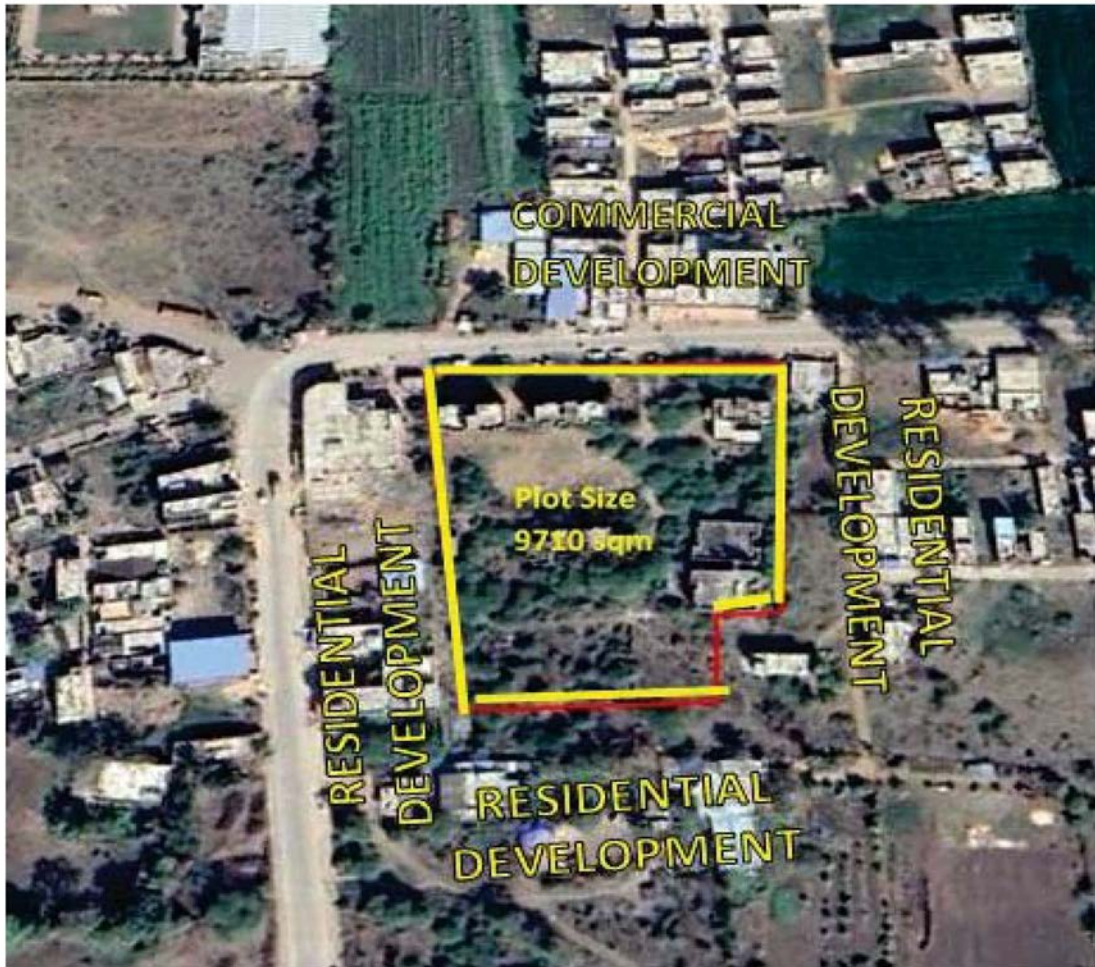
Location of Subject Site