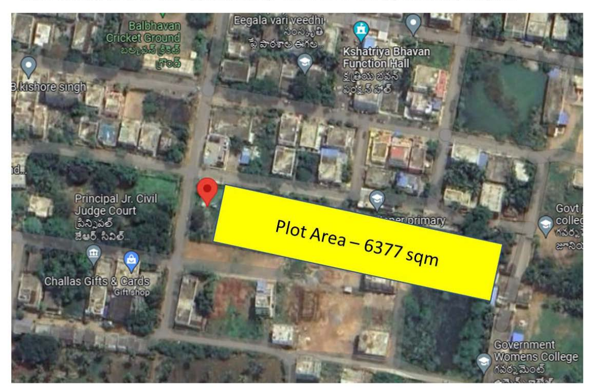
Location of Subject Site

The subject site is situated at 17°21'02.1"N 82°32'38.0"E in close proximity to educational institutions. The site can be accessed by 2 roads. The subject site is located and surrounded by residential colonies. Government Women's College and Upper primary school are near the subject site. A judicial Court is proposed to be developed opposite the site. The subject site is at a distance of approx. 3 Km from NH 16, approx. 4 Km from Tuni RTC Bus Complex, approx. 2.5 km from railway station and approximately 100 Kms from Rajahmundry Airport.